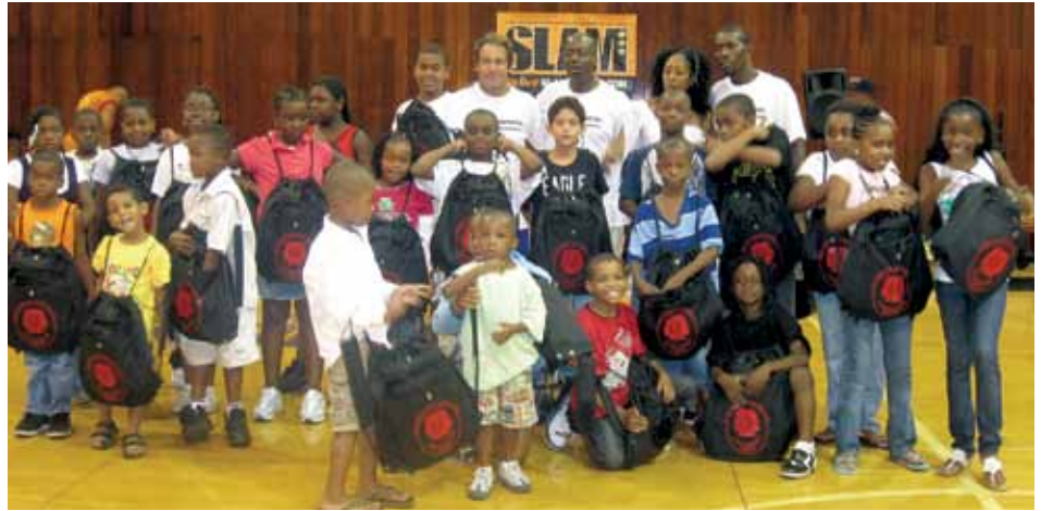
GLK and the Gardiner Foundation with some of the winners of the backpacks filled with school supplies.

Although local spectators and basketball fanatics were thoroughly entertained throughout the day, everyone remembered the real reason they were there — to support and encourage our youth and to bring the community together to honor and comfort those who have lost loved ones. The Gardiner Foundation, which runs